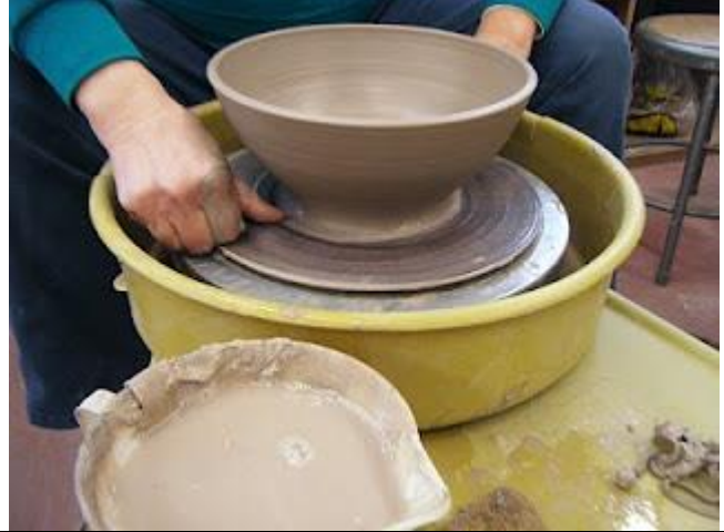
5. Wire off